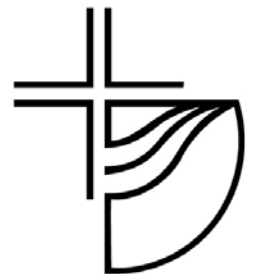
The cross, the wave, and the towel are symbols of our new life in Christ.